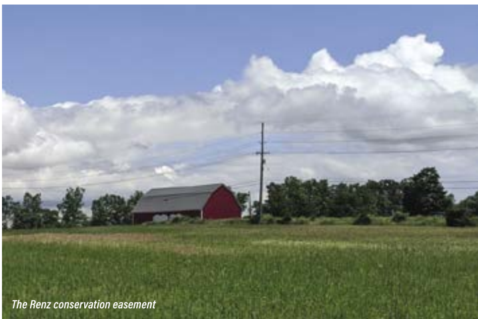
The Renz conservation easement

December 3: Explore the marvelous Mill Creek headwaters at Sloan Preserve , 1985 Baker Rd.