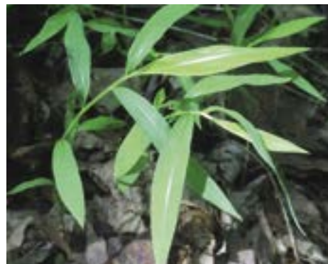
Stiltgrass with distinctive mid-leaf stripe

By mid-June stiltgrass ( Microstegium vimineum ) has emerged across Scio Township and parts of Washtenaw, Lenawee, and western counties. Stiltgrass is an annual that can grow anywhere—full sun or deep shade, moist or dry soil. This floppy grass drops additional roots from the leaf nodes (hence, stiltgrass) and can sprawl many feet. One plant can produce from 100-1,000 seeds by late August/early September. Seeds are very lightweight and easily washed downhill. Lawns of stiltgrass can set seed at