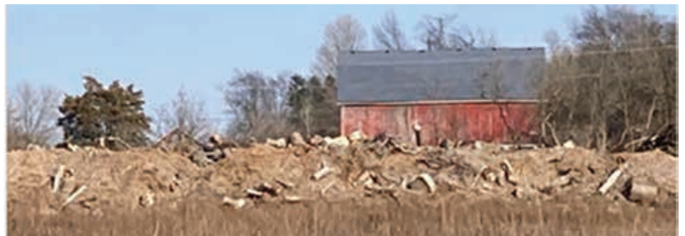
Hugelkulture at Tantre Farm: You can see huge piles of logs and woody brush and vegetable debris (much of it the result of last winter's ice storm) piled high with wood chips and leaves filling in on top of the long rows.

The benefits of hügelkultur to the farm and ecosystem include reducing runoff, relying on seep moisture to keep plants watered, encouraging good soil bacteria, and sequestering carbon in the soil rather than releasing it into the atmosphere. To learn more, visit offthegridnews.com and search for hügelkultur.