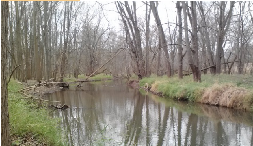
Sloan Preserve

The Township is looking for ways to develop our parks with volunteers and grants until it is determined that a permanent source of revenue is needed.