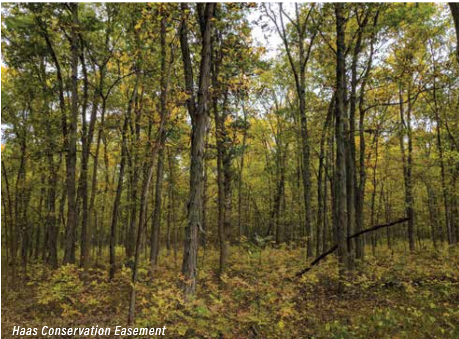
Haas Conservation Easement

The funds provided by this millage will also enable the Township to apply for grants to assist in park and pathway development. This is an exciting time for nature-loving Scio residents. Each of these projects will take time to complete—years in fact. But with careful planning and the funds that Scio Township voters approved in August, we can begin to make progress on our residents' desire for accessible green spaces and non-motorized paths to get to them.