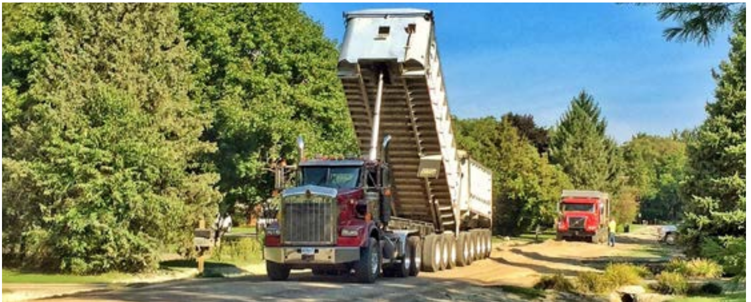
Above: Gravel trucks delivering material for local road improvement.